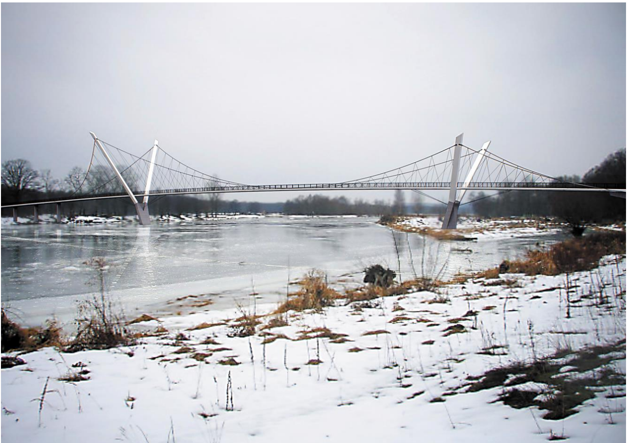
Fig. 1. Footbridge over the Bug River in Niemirów

The presented project was developed to accordance with the terms of the competition term that the costs may not exceed PLN 7 million. A steel hanging structure with a wooden deck was proposed