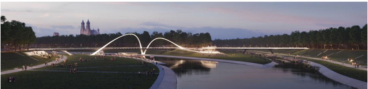
Fig. 3. Design of Berdychowska Footbridge in Poznań

The footbridge connects the center of Poznań with Ostrów Tumski Island and the university campus. It is an arch bridge with five spans. The result is an interesting object with great aesthetic and functional qualities.