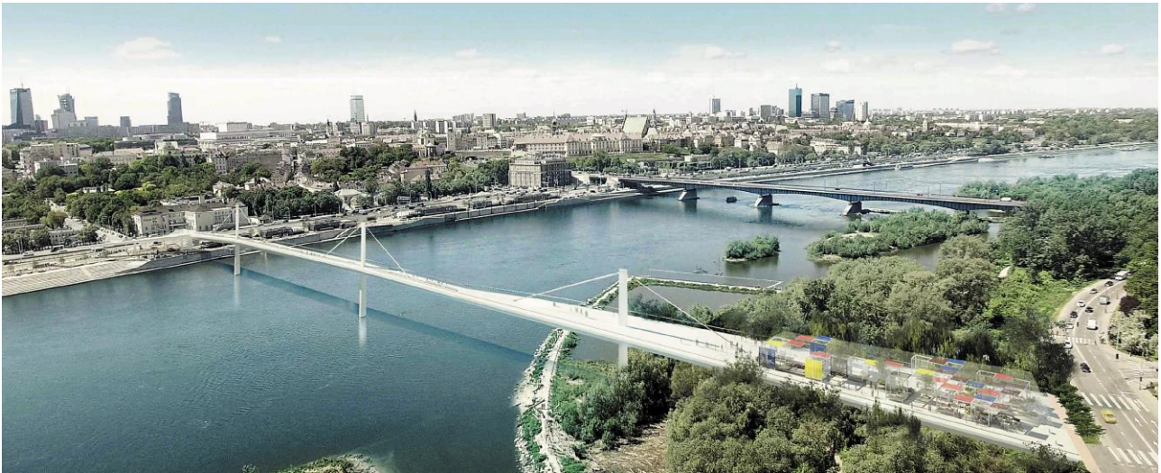
Fig. 2. Footbridge over Vistula River in Warsaw