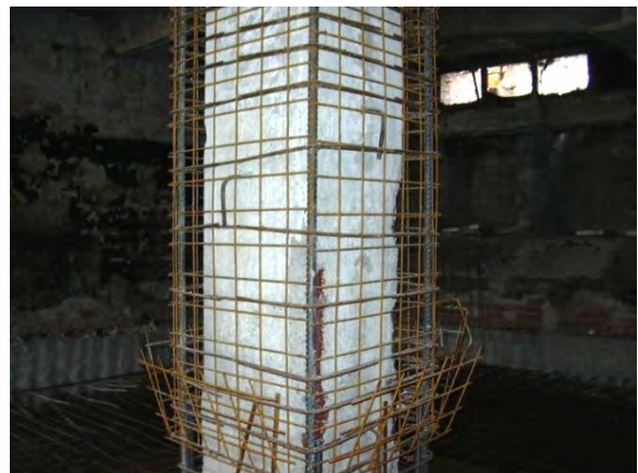
Fig. 3: RC strengthening of columns

The rehabilitation of the RC structure, performed in 2008, was adopted for both types of damages. The strengthening consisted in jacketing with reinforced concrete of columns and foundations. For columns the previous experimental studied solution was adopted by using chemical anchored connectors (Fig. 3). The strengthening solution adopted for beams and slabs was based on carbon fibre polymer composites (CFRP): longitudinal CFRP lamellas and transversal CFRP wrap for beams; CFRP wrap for slabs.